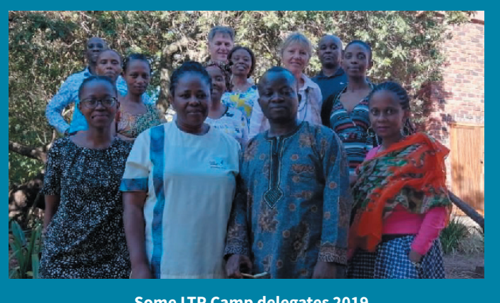
Some LTP Camp delegates 2019

Contact Christel Hattingh: admin@icld.co.za